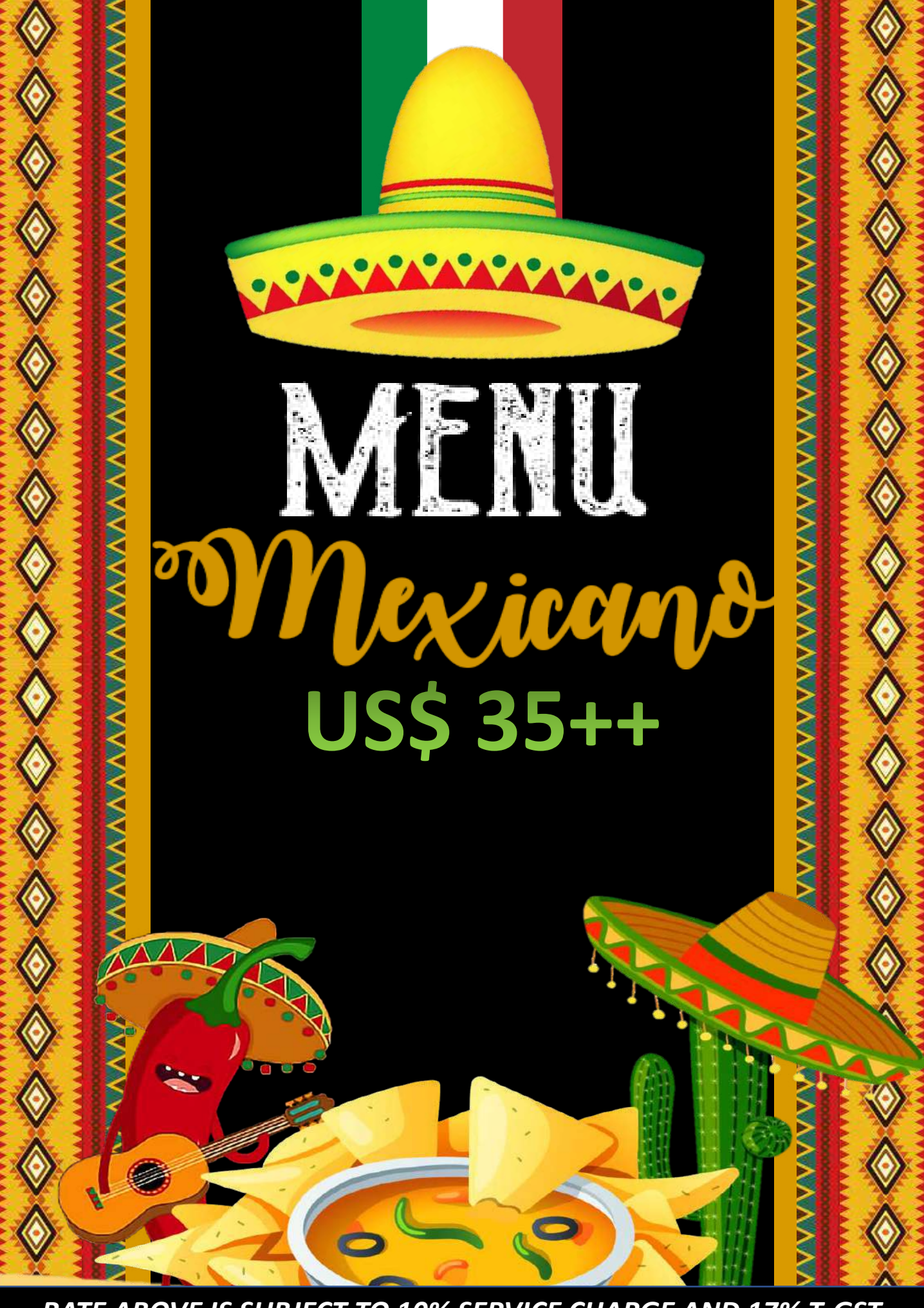
RATE ABOVE IS SUBJECT TO 10% SERVICE CHARGE AND 17% T-GST